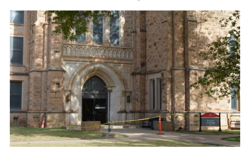
Figure 1 Safety tape blocks main entrance to the Marshall Building.

Phillips University alumni and friends who attended Vespers on Friday, June 23 were greeted by safety tape blocking the main entrance to the Marshall building.