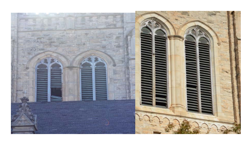
Figure 2-3 Damaged louvers on the Marshall Building bell tower, east view.

Earlier that week, a storm had damaged the bell tower, dislodging many slats from the louvers on each side of the tower. Northern Oklahoma College – Enid (NOC-Enid) mitigated the risk of injury from falling slats by closing the main entrance.